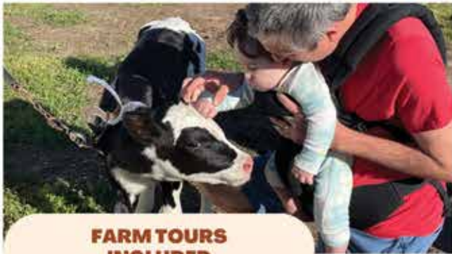
FARM TOURS INCLUDED