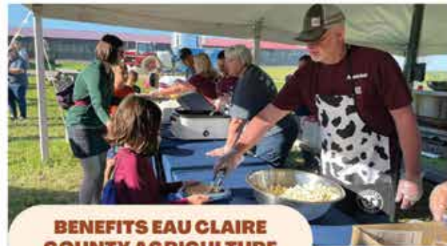
BENEFITS EAU CLAIRE COUNTY AGRICULTURE

Come out to enjoy breakfast, educational booths, farm tours, face painting, and much more!