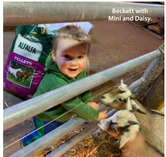
Beckett with Mini and Daisy.