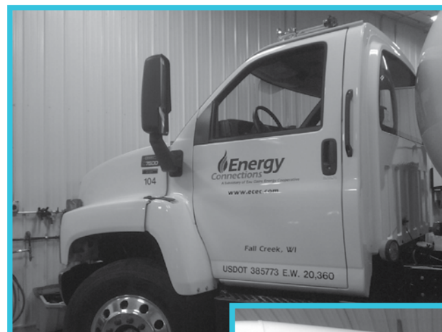
Energy Connections now has two propane fueled delivery trucks in the fleet.

Unlike natural gas, propane is not a greenhouse gas when released directly into the atmosphere. When considering the entire lifecycle of propane used in converted light-duty vehicles, it has been found that propane reduced greenhouse gas emissions by 21% to 24% and petroleum use by 98% to 99%.